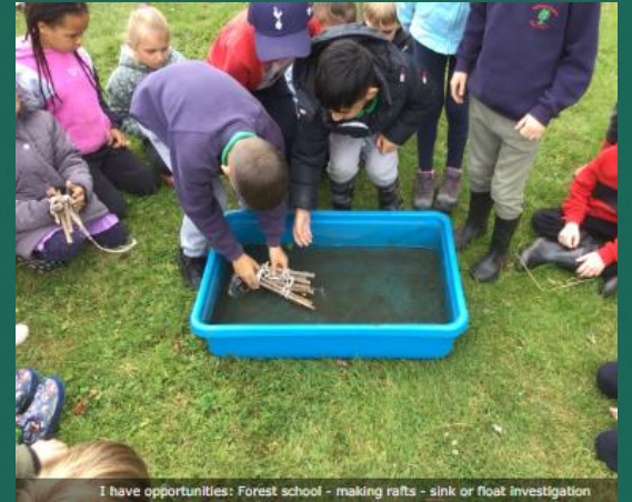
I have opportunities: Forest school - making rafts - sink or float investigation